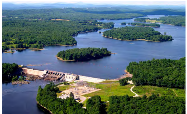
Maine has large impoundments also. Gulf Island Pond, Androscoggin R.

The cumulative impact of less silica being transported each year to the ocean has resulted in fewer and smaller diatoms. ( Silica forms the cell walls of diatoms, key single organisms at the base of the marine food chain.-ed. note ) Depleted diatom populations fail to support a healthy food chain or ameliorate ocean acidity, and they'll release less oxygen into the atmosphere. This has led to the starvation of creatures and fishes that eat them and increased acidity. The silicate of the smaller diatoms dissolves before the carbon can be sequestered to the ocean floor.