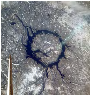
Manicouagan Reservoir - NASA

Every reservoir hydroelectric facility represents an environmental catastrophe , not only to the dammed river, but also to the ocean regions where the rivers' currents convey nutrients. Commissioned in 1969, the Outardes-4 hydroelectric reservoir dam on the Outardes River discharges into the St. Lawrence River. Its surface area is 252 square miles – five times bigger than Sebago Lake.